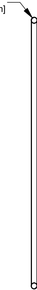
SECTION A-A SCALE 1 / 2